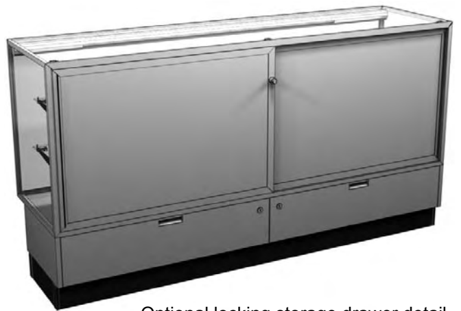
Optional locking storage drawer detail