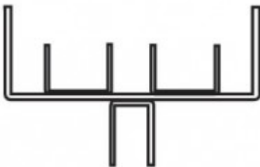
Rail for Multiple Backs