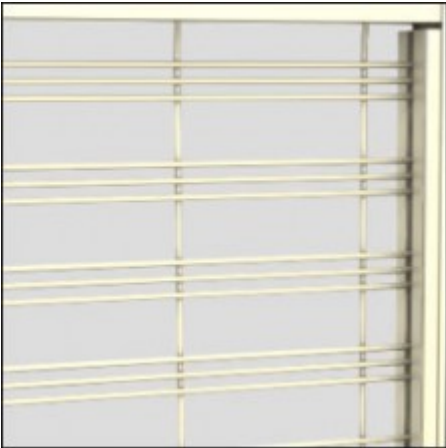
MG = Multi-Grid