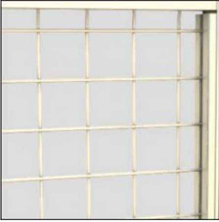
WG = 3x3 Wire Grid